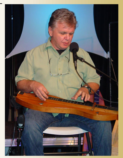
Minstrel Of The South